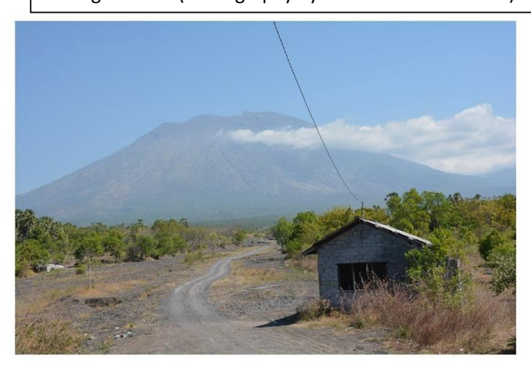
Mt Agnu. Bali.

Prompts. Think about; tectonic processes, threats, impacts, risks and management.